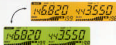
Selectable Green and Amber Display.