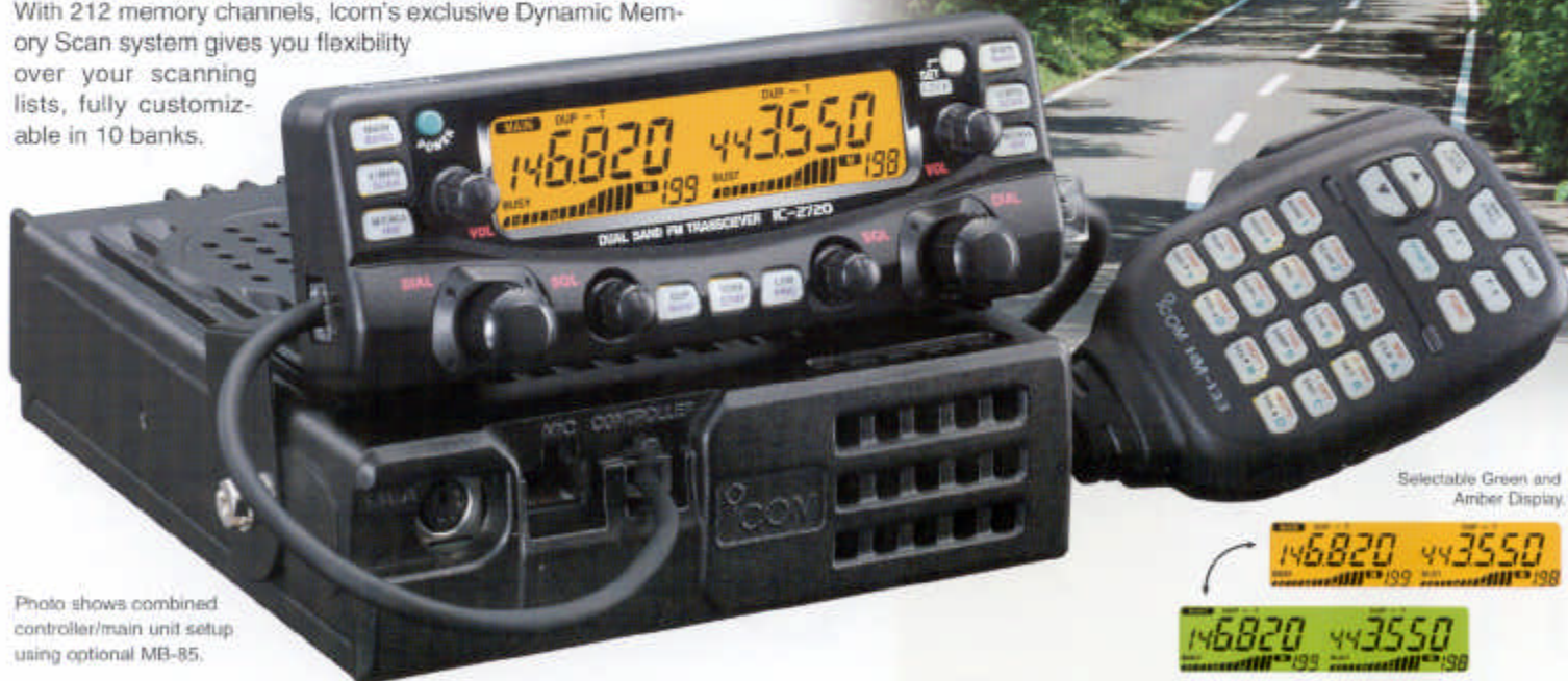
Photo shows combined controller/main unit setup using optional MB-85.

With 212 memory channels, Icom's exclusive Dynamic Memory Scan system gives you flexibility over your scanning lists, fully customizable in 10 banks.